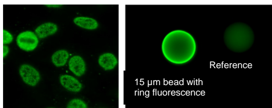
Example of an ANA positive result for RNP-Sm: the HEp-2 cells display clear, green fluorescence as well as a clearly recognizable course speckled pattern. The 15 µm bead in compartment II (RNP-Sm) shows a clear, green ring fluorescence.

A sample dilution is reported as ANA positive, if HEp-2 cells demonstrate a fluorescence of 1+ or greater, as well as a clearly visible fluorescence pattern. Ring fluorescence of the antigen coated beads shows the presence of the respective antibody: